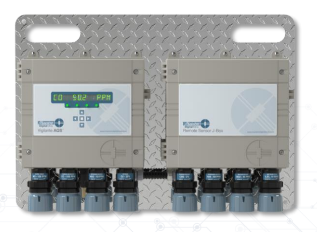
7 to 8 gas sensors DW1 option