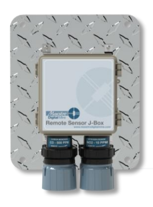
2 gas sensors