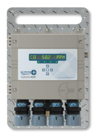
1 to 4 gas sensors IM option