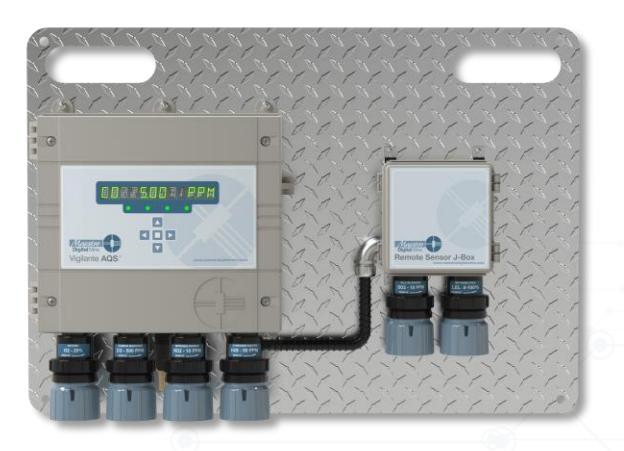
5 to 6 gas sensors DW1 option