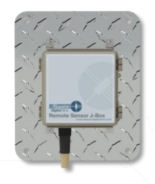
1 climate sensor