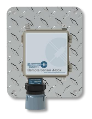
1 gas sensor

Vigilante AQS™ V2 & Zephyr AQS ™ - remote sensors mounted on a separate plate