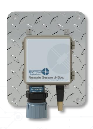
1 gas sensor &